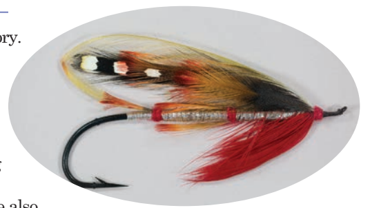
Above: Megan Red Sandy salmon fly.

Starting with classic and collectible bamboo fly rods, the most sought after rods are those that include the most famous brands, clearly marked on the rod, either with lettering on the bamboo itself (typically near the handle), or on the reel seat or fittings where the reel is attached to the rod. Some rod makers also included patent dates stamped on the reel seats or on the butt cap at the end of the rod.